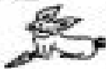
slow or fast