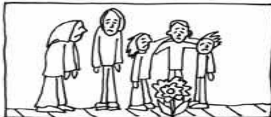
A beautiful flower growing in a grey, dismal setting.

FOCUS-MAIN IDEA-WHAT "GRABS" MY ATTENTION?