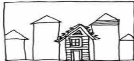
A house that stands out from the rest