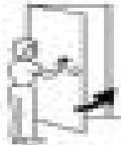
Close the door.