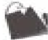
Close your back.