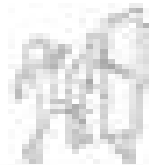
Open the door.