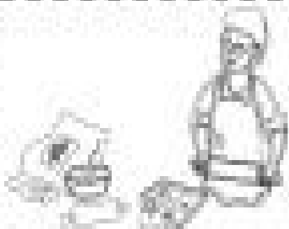
The little old lady made a gingerbread man.