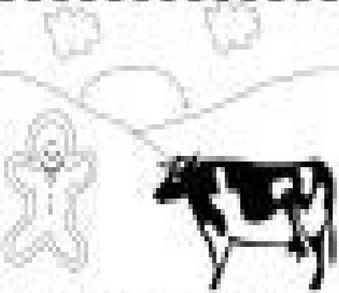
The cow? Well he's in the gingerbread Pan.