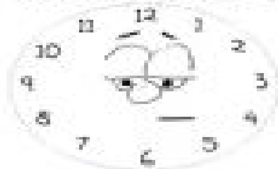
It's a quarter past noon.