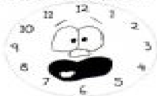
It's a quarter past eight.