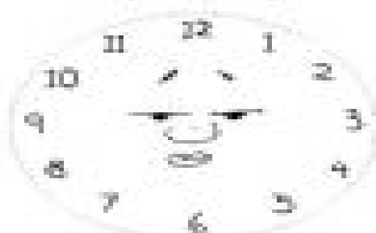
It's a quarter past noon.