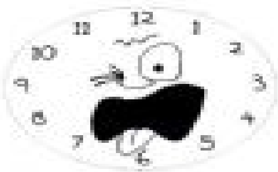
It's a quarter past noon.