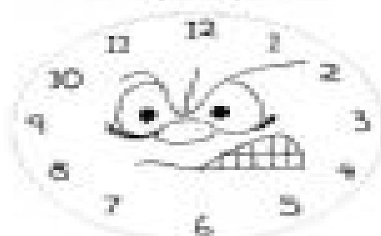
It's a quarter past noon.