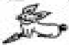
slow or fast