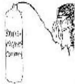
oxygen from a cylinder