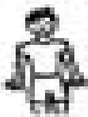
fat or thin / slim