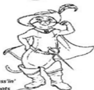
Puss 'n' Boots