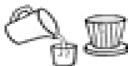
Dissolve in water and then use a filter.