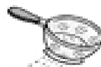
Use a colander.