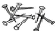
Steel nails and copper nails

On the left, you can see four mixtures. On the right are four different methods for separating mixtures. Draw a line between each mixture and the best separation method. On a separate piece of paper, explain your choice.