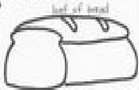
LOAF OF BREAD