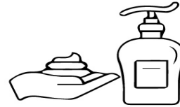
2. Use the soap