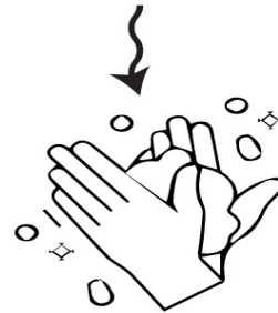
3. Scrub you back hands, wrists, between fingers, under fingernails.