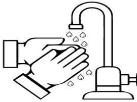
4. Rinse your hands