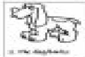
13. The dog barks.