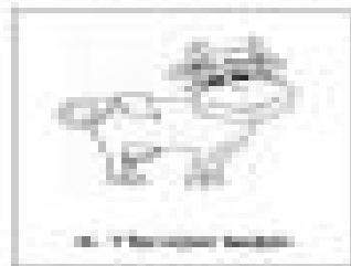
14. The dog wags its tail.