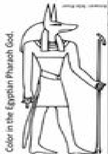
Color in the Egyptian Pharaoh God.