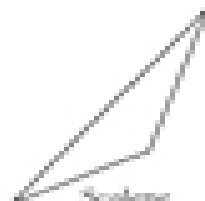
Scalene (all sides different)