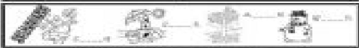
Don't forget the qualifications for each of these 3 concepts!