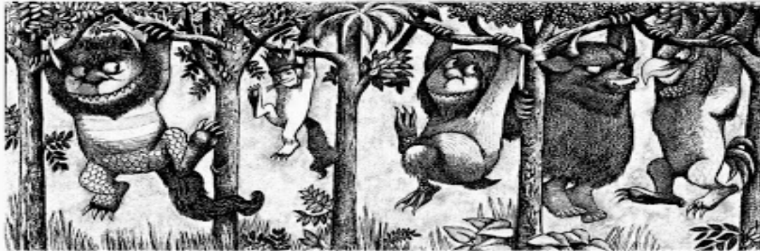
Where the Wild Things Are by Maurice Sendak, 1963

Varying the lines you use creates a more interesting drawing. This drawing uses straight lines (1), curved lines (2), thick lines (3), thin lines (4), hatching (5), cross-hatching (6), spirals (7), zig-zag (8), circular and dot shapes (9)