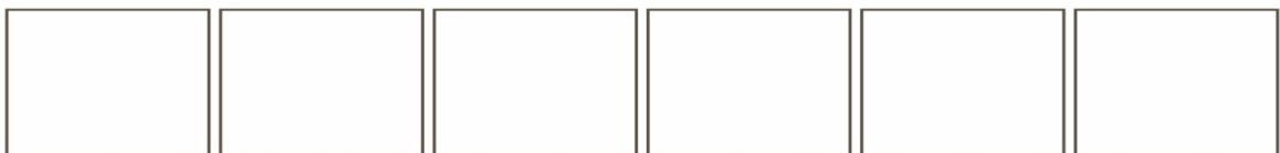
Invent your own technique