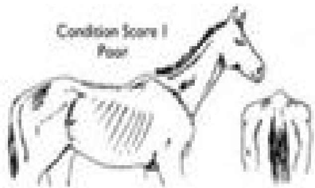
Condition Score 1 Poor