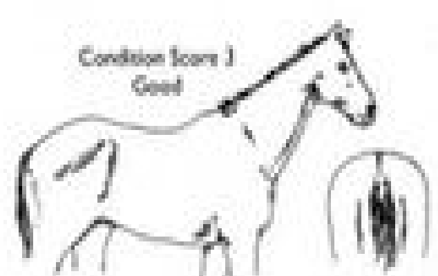
Condition Score 3 Good