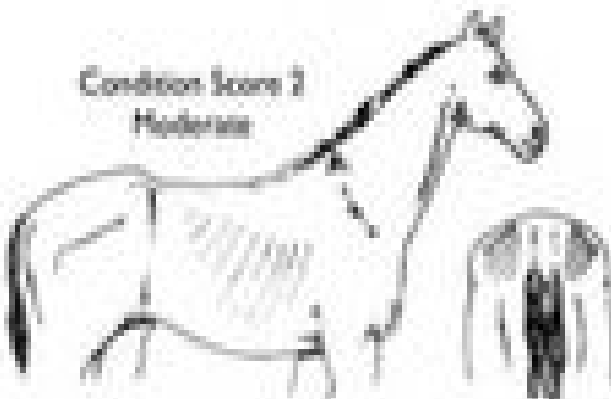
Condition Score 2 Moderate