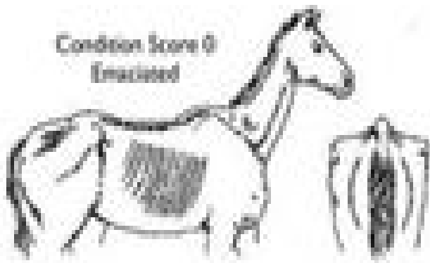
Condition Score 0 Emaciated