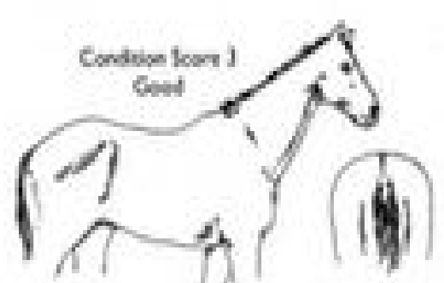
Condition Score 3 Good