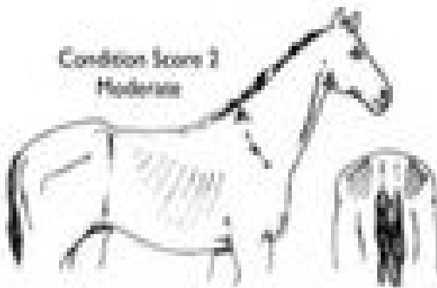
Condition Score 2 Moderate