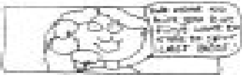
"I'll show you how to get rich. I'll give you $100,000. I'll give you $100,000."