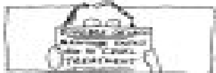
"I'll show you how to get rich. I'll give you $100,000. I'll give you $100,000."