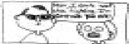
"I'll show you how to get rich. I'll give you $100,000. I'll give you $100,000."