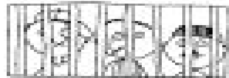
"My gang will take care of you."