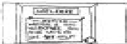
"I'll just go to work."