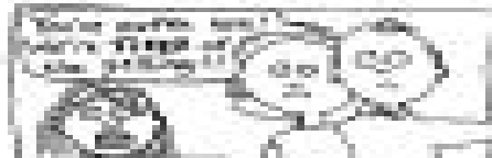
"You're really nice. I'd like to have a date with you." "I don't see how."