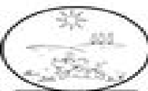
in the afternoon