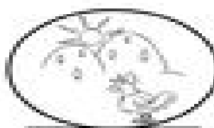
in the morning