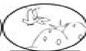
in the evening