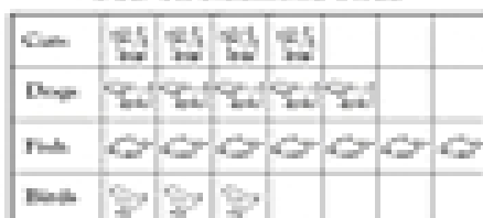
Pets on Redmond Road

On Redmond Road, are there more cats or dogs?