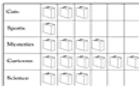
Books on Pablo's shelf

Look at this picture graph. Then answer the questions.