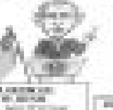
9. BARACK OBAMA - PRESIDENT