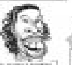
8. BOB DYLAN - SINGER - GUITAR PLAYER