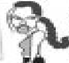
3. GEORGE CLOONEY - ACTOR