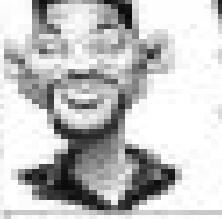
4. WILL SMITH - ACTOR AND - SINGER