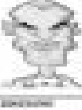
10. BILL CLINTON - PRESIDENT