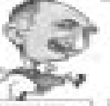
7. CRISTIANO RONALDO - FOOTBALL PLAYER