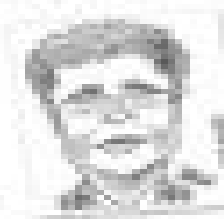
2. BRAD PITT - ACTOR