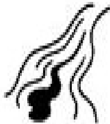
1. Waters to Blood