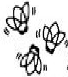
3. Gnats or Lice