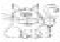
PERSON IS YELLOW