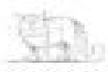
PERSON IS BLACK