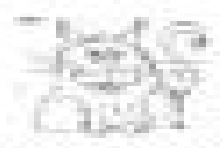
PERSON IS GREEN