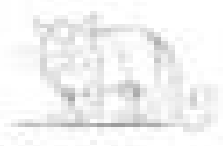
PERSON IS BLUE