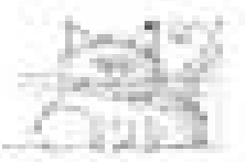
PERSON IS GREY