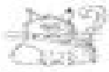
PERSON IS RED