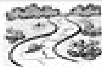
wavy garden path