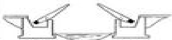
Double trunnion bascule