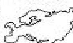
This is Europe.

Europe is the second largest continent. There are 50 countries in Europe. It is in the northern hemisphere.