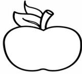
Cutting an apple