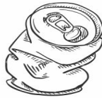
Crushing a can