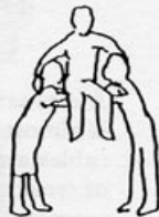
load and support