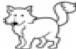
with a fox