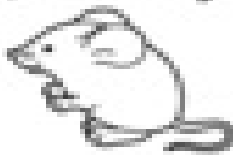
with a mouse