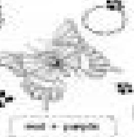
6 - butterfly