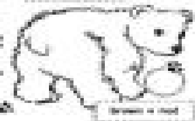
8 - bear