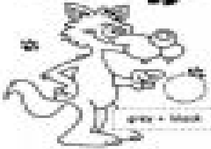
5 - rabbit