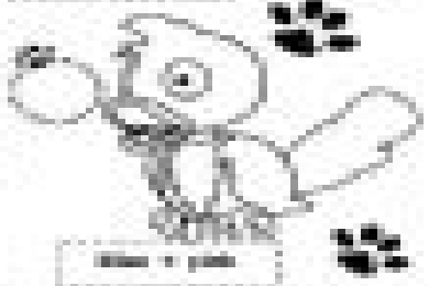
11 - parrot