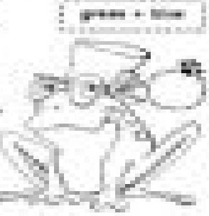
2 - frog