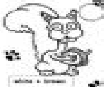
10 - squirrel