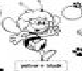
9 - bee