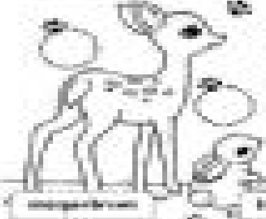
1 - deer