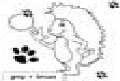
3 - bear