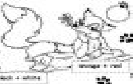
12 - mouse