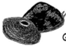
Giant Keyhole Limpet