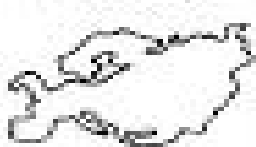
This is Europe.

Europe is the second largest continent. There are 50 countries in Europe. It is in the northern hemisphere.