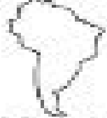
This is South America.

South America is the largest continent. There are 12 countries in South America. It is in the southern hemisphere.