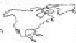
This is North America.

North America is the second largest continent. There are 23 countries in North America. It is in the northern hemisphere.