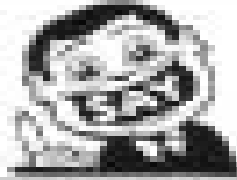
Say - Syy - Syy