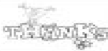
Thank - Thanke - Thanke