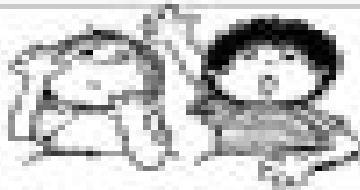
Can you repeat? - Teebak: aditilik Bilant