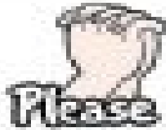
Please - Pleez - Pleez