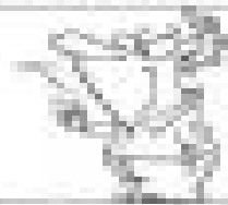
Excuse me - Nidurwala