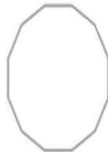
Dodecagon – 12