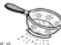
Use a colander.