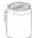
a fatty drink