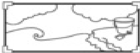
3. _____ erosion is caused by the force of breaking waves against the shore, which washes sand away.