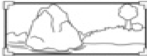
1. _____ erosion is caused by the rubbing and scraping movement of glaciers.

Directions: Look at the illustrations below. Fill in each blank with the correct word(s) to identify each type of erosion.