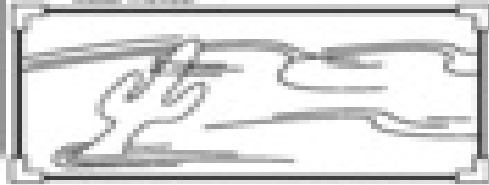
4. _____ erosion is caused by the action of moving air and also by the rock particles present in it.

Directions: Read the descriptions below. Make a ✓ in the box to identify each type of erosion.