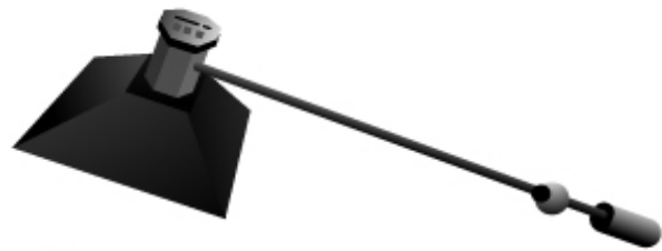
SB800 flash ixSmall Photoflex softbox to provide hair and separation light 1 full CTO gel