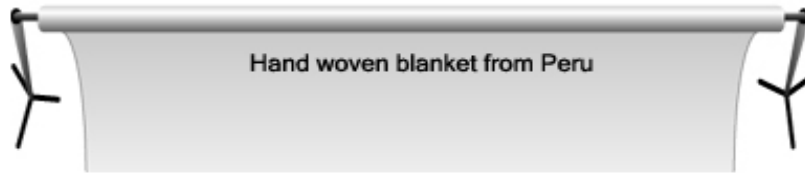
Hand woven blanket from Peru