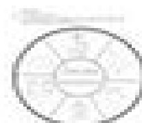
clip it sounds