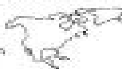
This is North America.

North America is the largest continent. There are 23 countries in North America. It is in the northern hemisphere.