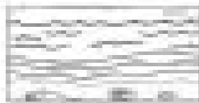
SEA / OCEAN

SEA / OCEAN / LAKE / RIVER / MOUNTAIN / DESERT / PLAIN / WOOD