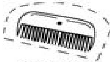
MANE & TAIL COMB