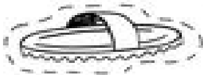
RUBBER CURRY COMB