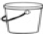
5. a large bucket

Now estimate the capacity of each container below.