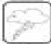
WINDY - CLOUDY