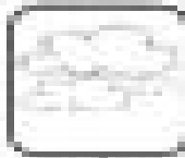
CLOUDY - WINDY