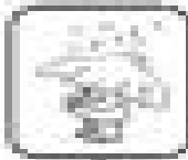
WINDY - CLOUDY