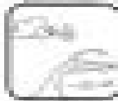
WINDY - CLOUDY